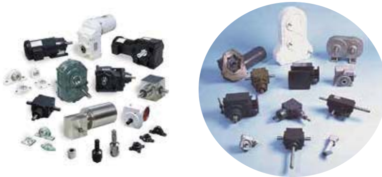
Standard, modified & custom units are built for countless applications.

We know time is valuable, that's why you can count on HUB CITY for support, services and solutions to simplify your installation. Select from a complete line of standard or custom design products.