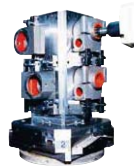
A multi-pallet machining center machines precisely and efficiently.