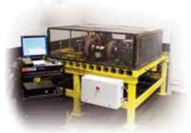
State-of-the-art testing equipment and comprehensive product testing ensures quality.